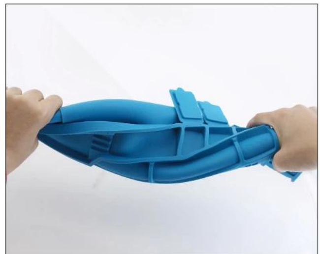
Soft silicone, full of elasticity