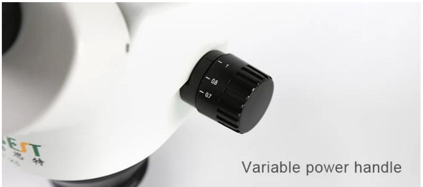
Variable power handle