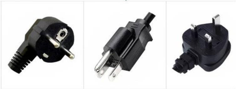
European regulations 220V-50Hz